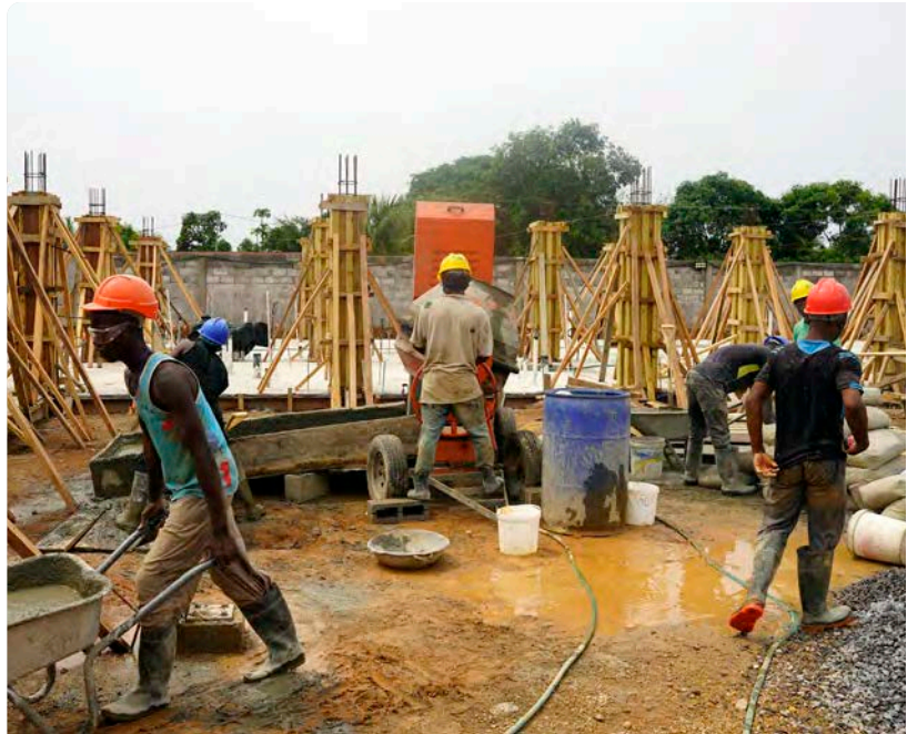
The speciality care baby unit at PIH-supported Koidu Government Hospital in Sierra Leone is a specialized unit that provides advanced, lifesaving care for newborns.