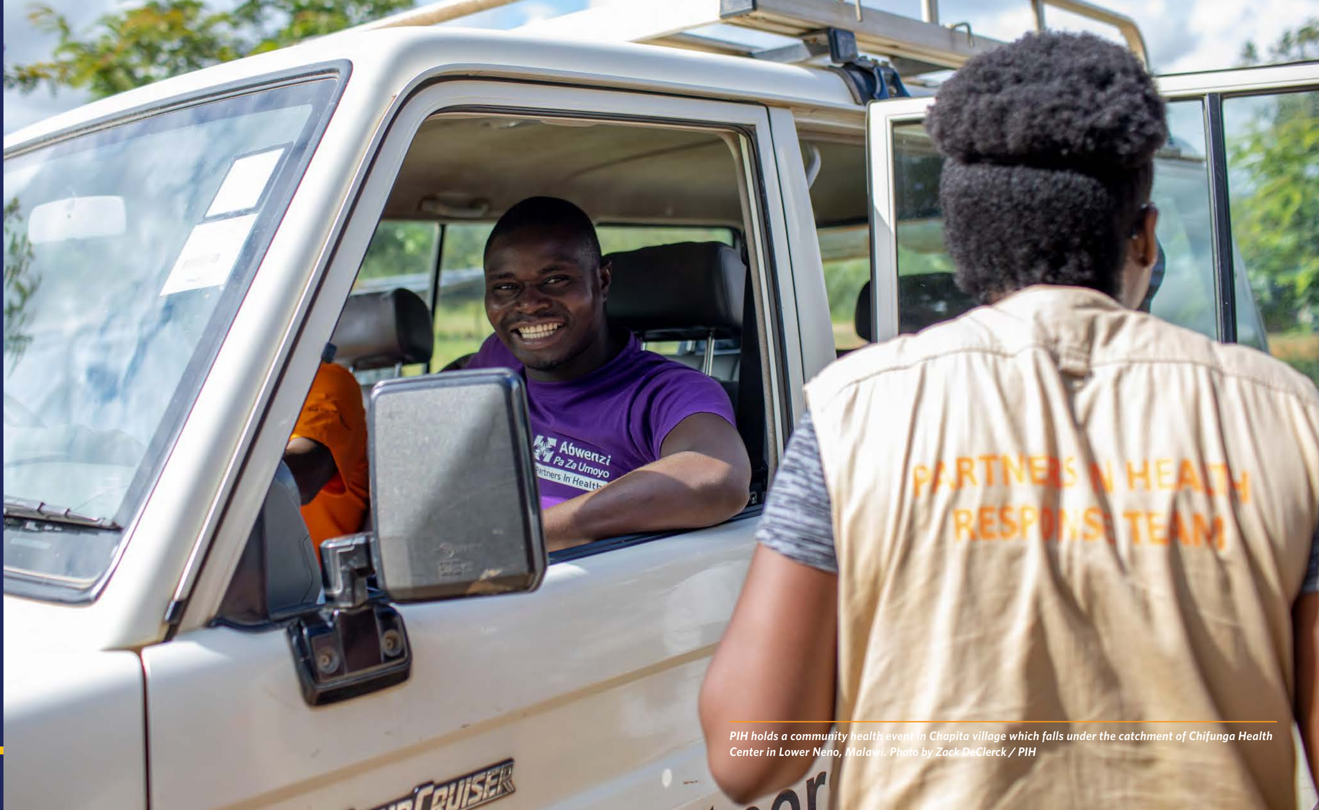
PIH holds a community health event in Chapita village which falls under the catchment of Chifunga Health Center in Lower Neno, Malawi.

Partners In Health's more than 17,300 global staff – physicians, nurses, community health workers, drivers, supply chain experts, and so many others – are the heart of the organization. More than 98% of all staff are from the countries where we work, inspired and deeply committed to serving their own communities.