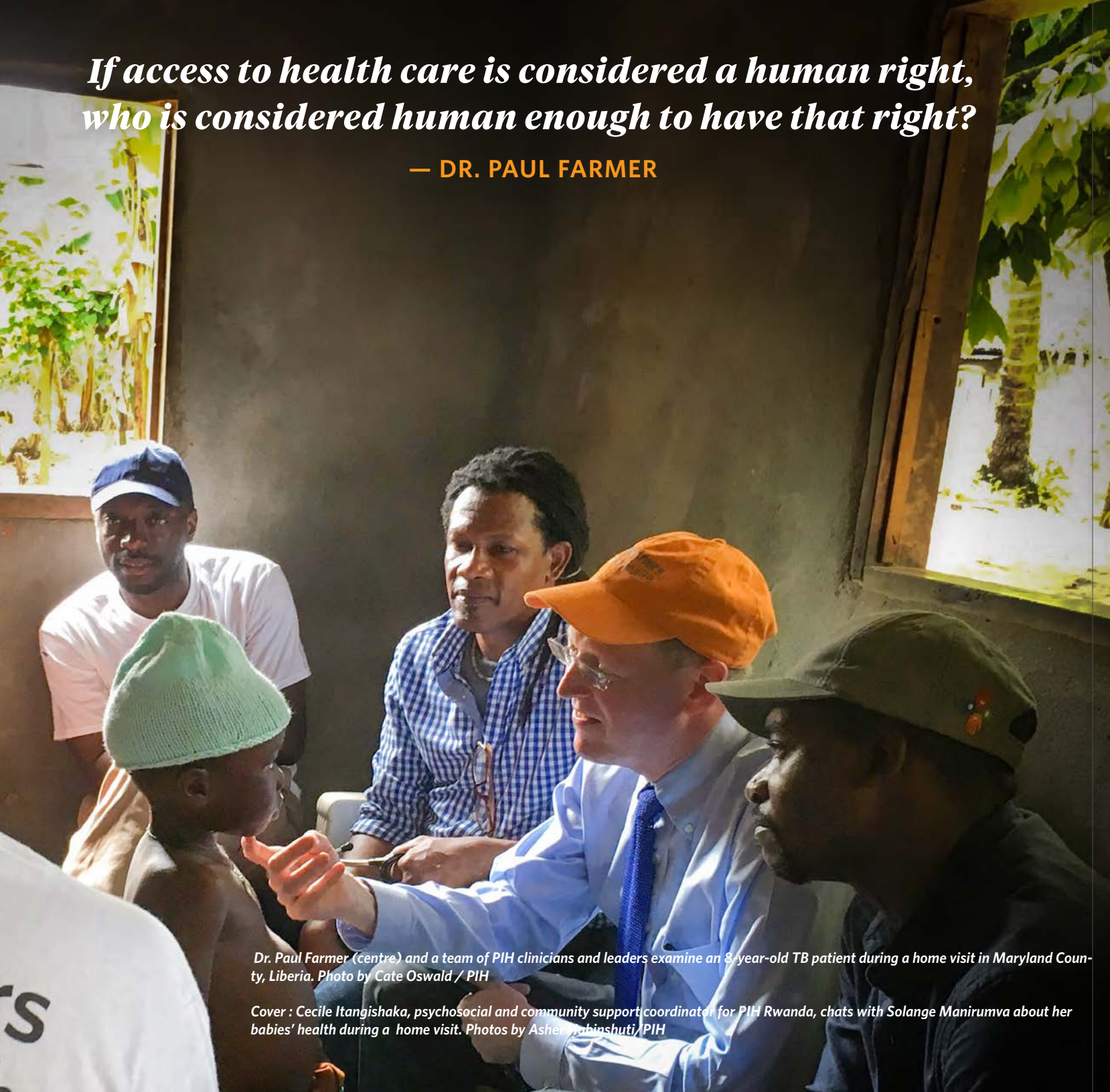
Dr. Paul Farmer (centre) and a team of PIH clinicians and leaders examine an 8-year-old TB patient during a home visit in Maryland County, Liberia.