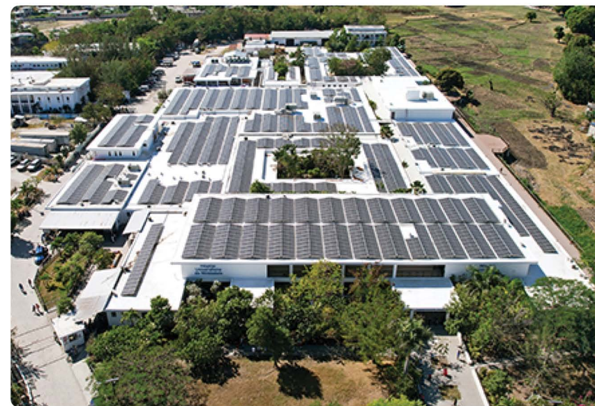
An aerial view of the solar panel system on the roof of Hôpital Universitaire de Mirebalais.

medication storage, rely heavily on a stable power supply. By harnessing solar energy, HUM will significantly reduce the challenges of maintaining a steady power supply. ■