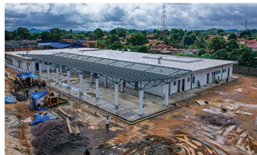
Aerial view of the entrance to the birthing centre of the future Maternal Center of Excellence in Sierra Leone.

We look forward to this facility opening its doors to the women and children of Sierra Leone—and beyond—who will benefit from its expanded programs and comprehensive care. ■