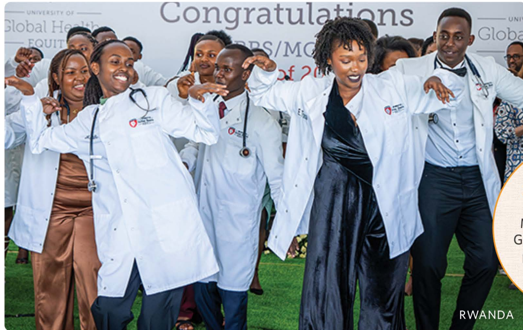
The third cohort of UGHE Bachelor of Medicine, Bachelor of Surgery students celebrate after receiving their white coats during a ceremony in Butaro, Rwanda.

228 graduates from UGHE's Master of Science in Global Health Delivery program since 2015