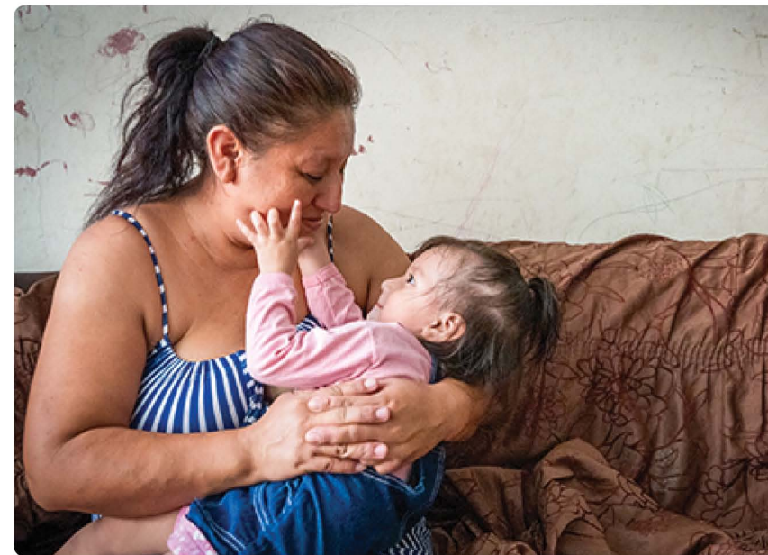
A mother, a participant in Socios En Salud's mental health program for pregnant women and mothers—Pensamiento Saludable, cradles her daughter.

The study also surfaced ideas for bolstering water supplies in the two communities. Participants' suggestions included establishing water cooperatives, sharing knowledge on recycling and conservation, cleaning and protecting natural springs, and developing storage solutions for rainwater. Using this input from community members, SES hopes to implement projects that help families better manage water resources and, in some cases, bring water directly to their homes. ■